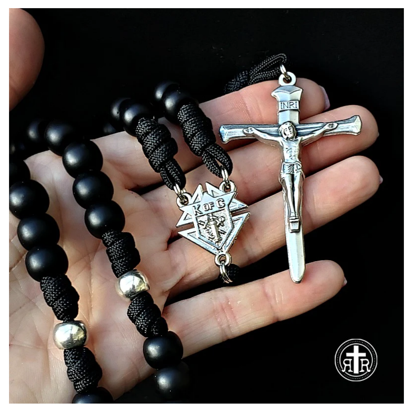
A portion of all Knights of Columbus sales goes directly to the Knights of Columbus Warriors to Lourdes program. We also donate these rosaries for that same program every year.

Rugged Rosaries is an official supplier for the Knights of Columbus Combat Rosaries and Paracord Rosary Collection. You will LOVE these strong durable KofC rosaries handmade in our studios in Texas. We supply rosaries that will enhance your faith and your prayer life and your devotion to Our Lady: